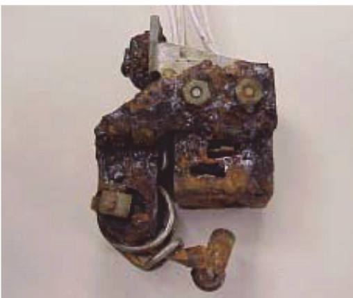
Untreated - failure after 100 hours saltspray test