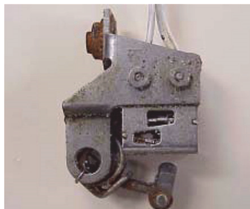
Treated with SuperCORR A - passes up to 1400 hours saltspray test